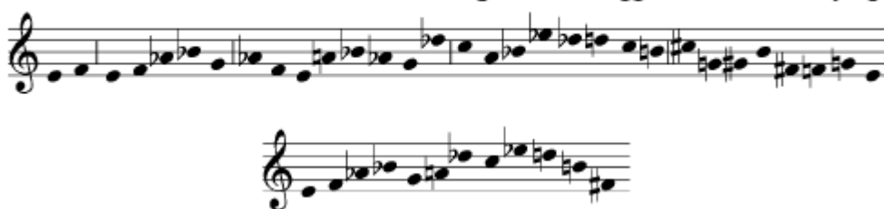
EXAMPLE 6: York Höller, Der Meister und Margarita , “Klanggestalt” and underlying row

Besides determining overarching as well as local aspects of the composition, the Klanggestalt generates quasi-melodic offspring. Of particular interest for Höller’s musical interpretation of Bulgakov’s tale is the fact that these derivative entities define the various persons and situations as projections emanating from the Master. His own tone row is identical with the original form of the Klanggestalt ; Margarita’s is an augmentation of all intervals to roughly twice their size (where the “roughly” guarantees that the augmentation results in what is once again a derivation of a complete twelve-tone row); the satirical debunking of Moscow society in the variety theater draws on the enlargement of the formula to about triple depth, and Woland is depicted in shapes that blow up the basic row to grotesquely leaping intervals approximately six times the size of those characterizing the Master. (Example 6 shows the opera’s Klanggestalt next to the dodecaphonic row from which it is derived; example 7 juxtaposes the Master’s, Margarita’s, the Muscovites’, and Woland’s lines, each consolidated for easier comparison to the twelve-tone source on which they draw.)